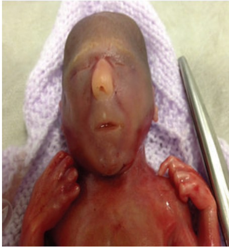
FIGURE 2: Photograph taken in the immediate postnatal period.

a parent with a balanced translocation. Understanding the individuals' phenotype in association with the gain and loss of copy number is important and can further provide us with information on that particular region of the named chromosomes.