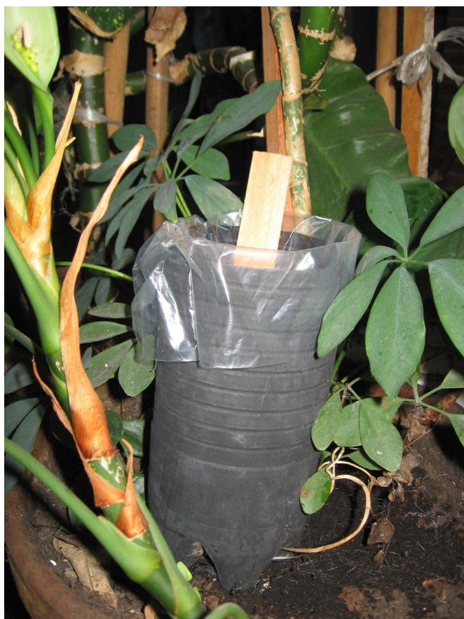
FIGURE 2. Ovitrap with paddle.

The Ceratopogonidae identified species was D.