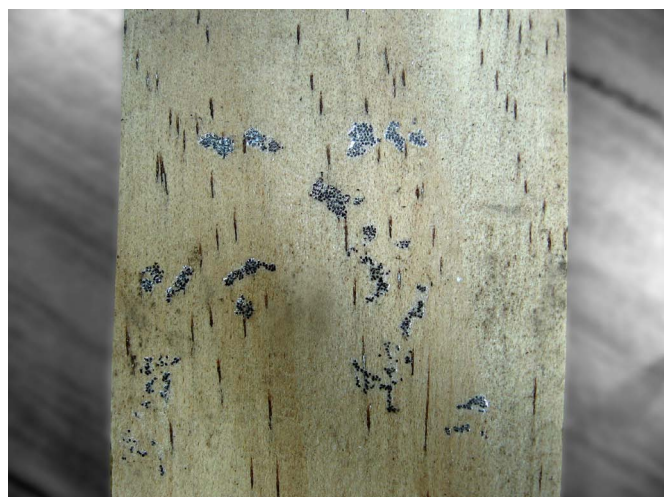
FIGURE 4. Egg mass of Dasyhelea necrophila in a paddle.

The knowledge of the breeding sites of different Diptera in the same habitat is very important to application of methods for biological integrative control, especially species with economical and sanitary relevance which share the same habitat for ontogenetic development.