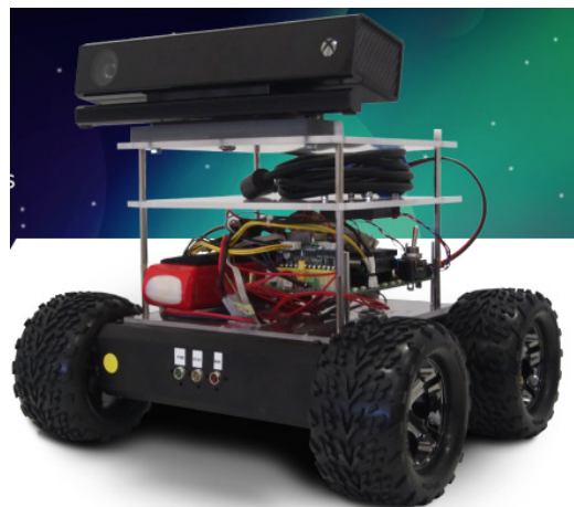
Figure 1. ARAS rover

This rover is able to provide a continuous TPVA solution, both in local or global coordinates and regardless of indoor or outdoor scenarios. Hence, the TPVA solution will take into consideration only the available sensor's data at the moment of the processing.