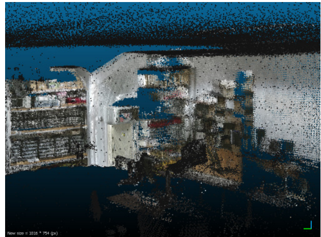
Figure 4. RTABMAP model of our laboratory

A variation of the example above would compute mapping solution in real-time but log these data to permanent storage instead. This capability is of special relevance in emergency scenarios where quick charting is required (Angelats and Navarro, 2017). ARAS would collect raw data of positioning and perception sensors and would process it on-board. Thanks to its obstacle and avoidance module it is able to autonomously map an entire floor. Once the acquisition mission finish, the user can download the processed point cloud and start its processing. ARAS is now providing 3D point cloud with 10 cm precision and 20 cm, accuracy after 5 minutes of mission.