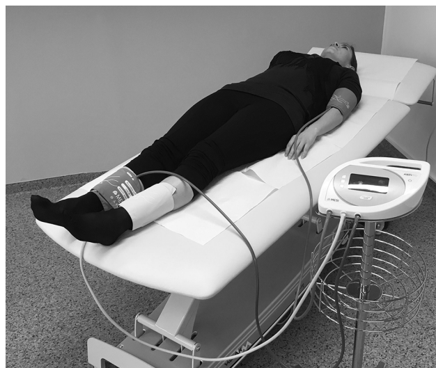
Figure 1 Picture of the MESI ABPI MD ® (MESI d.o.o., Ljubljana, Slovenia) device.

Measurement of ABI by means of Doppler probe method (ABI dop ) was performed according to the standard protocol 9 with a calibrated sphygmomanometer and 8 MHz Doppler probes (Dopplex SD2, Huntleigh Healthcare Ltd, Cardiff, UK). ABI dop was calculated as the ratio of the highest systolic blood pressure (SBP) obtained from both tibial and dorsalis pedis arteries at one ankle to the highest SBP of both brachial arteries. ABI dop_L refers to ABI values obtained on the left leg, ABI dop_R on the right leg. Measurement of ABI (ABI mesi ) with the improved automated oscillometric device (MESI ABPI MD; Figure 1) was performed according to the manufacturer's instructions. In short, MESI ABPI MD system is based on simultaneous plethysmographic measurements through three cuffs, one conical cuff placed on the right or left arm, and two conical cuffs placed on each of the ankles. Precisely regulated system inflated and then deflated the three cuffs simultaneously at the same pressure level. Heart beats create oscillations on the plethysmographic signals, which are used to calculate blood pressure values from the three limbs using specific proprietary algorithms for the ankle blood pressure determination. The ankle cuffs measure oscillometric signals over the whole ankle and hence the highest SBP of all arteries within the ankle is detected.