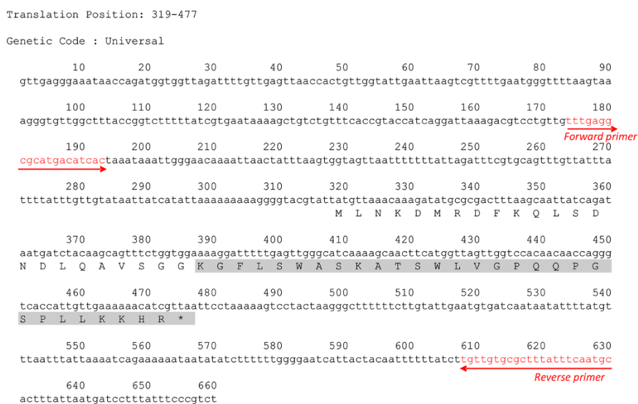
Figure 1 Nucleotide sequence of the weissellicin L gene and the deduced amino acid sequence. An asterisk indicates the translation stop site. The mature weissellicin L peptide is highlighted in grey.

The activity of a dedicated ATP-binding cassette (ABC) transporter is required for the secretion of many class II bacteriocin in Gram-positive bacteria (Michiels et al. 2001). A double-glycine-type leader could always be observed with two glycine residues located at positions -1 and -2 of the leader peptides. This double-glycine sequence is a hallmark of the class II bacteriocins exported through ABC transporters (Dimov et al. 2005; Michiels et al. 2001). In this study, the double-glycine-type leader sequence