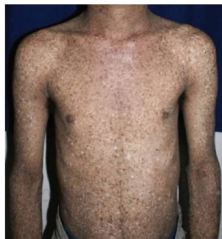
FIGURE 2: Mottled hyperpigmented and hypopigmented areas giving salt and pepper appearance to skin.

the former group and a disinclination of this group to go out in sunlight without protection.