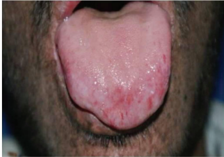
FIGURE 4: Precancerous lesion affecting the tip of the tongue.