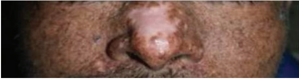
FIGURE 3: Atrophic, hypopigmented skin of the nose.