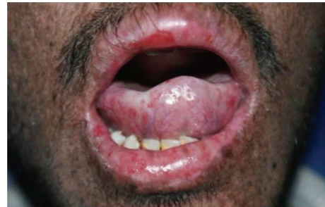
FIGURE 6: Decreased mouth opening affecting oral hygiene.

varying from the age of two to middle age [26, 28]. It is presumed that as a consequence of defective DNA pathways associated with mutated XP genes, neurons accumulate endogenous genotoxic-induced DNA damage and undergo apoptosis leading to loss of neurons [18]. The neurological abnormalities include isolated hyporeflexia, progressive mental retardation, sensorineural deafness, spasticity, or seizures [30].