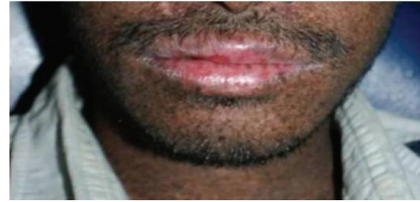
FIGURE 5: Actinic cheilitis of upper and lower lips.