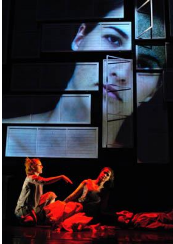
Fig 7: The Company in Future of Memory (2003).

Perhaps a more primitive layer of consciousness is exhumed by the same ensemble's 16 [R]evolutions (2006), where motion capture software enables the body to write itself in performance, exploring through choreography and interactive media the similarities and differences between human and animal, and the behavioural evolutions that both go through in a single lifetime.