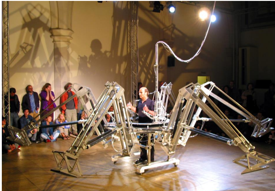
Fig 2: MUSCLE MACHINE , Gallery 291, London (2003). STELARC

In performances by the Australian Cypriot artist Stelarc, the body is coupled with a variety of instrumental and technological devices that are appropriated by it. One such is Muscle Machine (2003), where he constructed an interactive and operational system in the form of a walking robot. Rubber muscles are inflated with air, and as one set of them lengthens, the other shortens, so as to produce movement, translating human bipedal gait into a six-legged insect like motion.