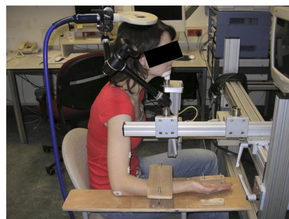
Figure 1 Position of the participant in a chair with the right arm placed in a fixed frame and a circular coil placed above the vertex. Written informed consent for publication of the image was obtained from the patient.

Participants were comfortably seated in a chair with their right forearm and hand supinated and supported by a custom built device (Figure 1). The elbow was positioned in 90 degrees flexion. The device restricted any movement of the upper arm, forearm, wrist, and fingers. Bipolar EMG-recordings were obtained using 2 pairs of self-adhesive surface electrodes (Ag-AgCl, solid gel, foam electrodes (35 × 22 millimeters)) placed in a standard tendon belly montage. EMG-signals were recorded using a CED (Cambridge Electronic Design Ltd) data acquisition and amplifier system with a bandpass filter of 20 to 3000 Hz at a display sensitivity of 0.5 microvolt/division (amplifier range 100 millivolt), using a recording