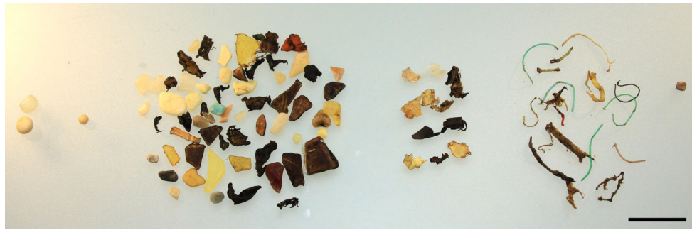
Fig. 1 Stomach plastic contents of an individual northern fulmar from Svalbard, 2013. L–R: Industrial pellets; probably industrial; fragments; sheets; threads; foam. Scale bar indicates 1 cm