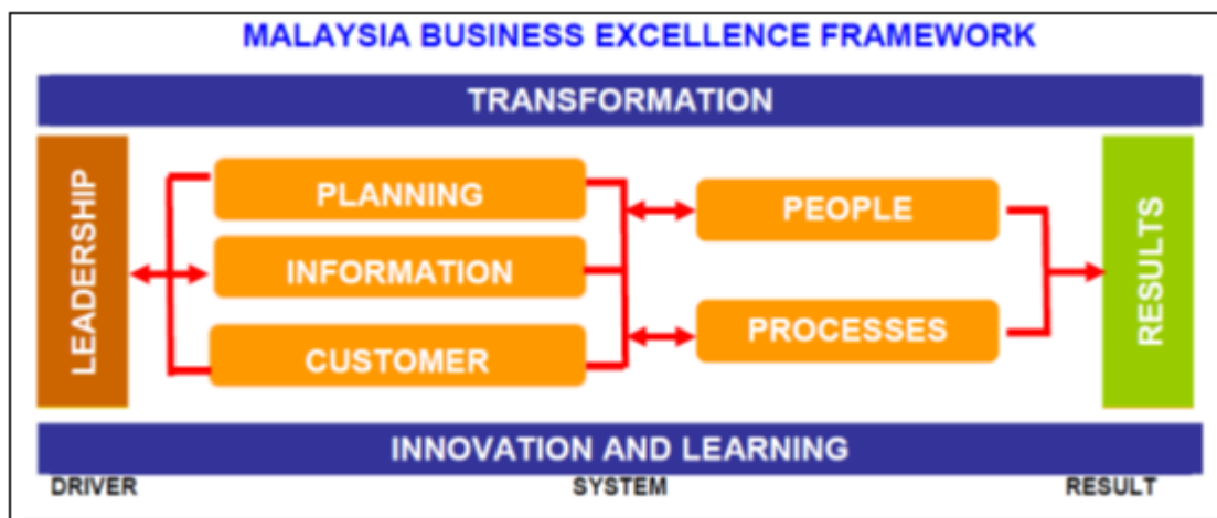
Figure 2.2: Malaysia BE Framework (Adopted from MPC, 2010)

In general, BEM is used in the following situations: