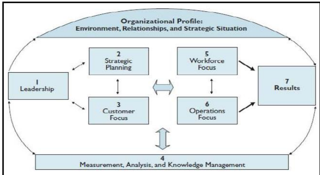
Figure 2.1: Interrelationship between each criteria in Baldrige CPE Model

The BEM in Malaysia is known as Malaysia BE Framework. The Malaysia BE Framework adopted the main concept from Baldrige CPE. It was used as a guideline for executives of organisations to review and assess their companies' affairs and performances. The aim of Malaysia BE Framework is to provide an optimistic prospect of the organisation with a continuous improvement that will lead to sustainable business success. It is used to improve any part of the organisation (MPC, 2011).