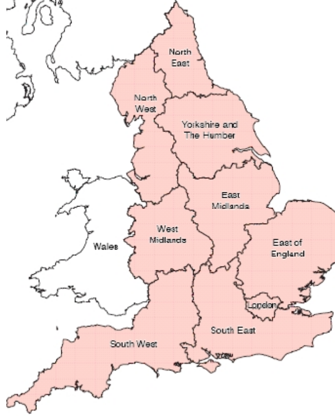
Figure 1: Government Office Regions (GORs) in England and Wales