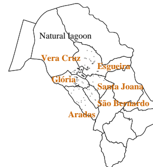
Figure1: Location of housing sample

The data cover single unit housing (12.3 percent) and flats (87.7 percent), both newly built (11.8 percent) and used (88.2 percent), located in different urban and suburban areas. Data on several physical and location attributes of each house were collected, as well as exact location of each