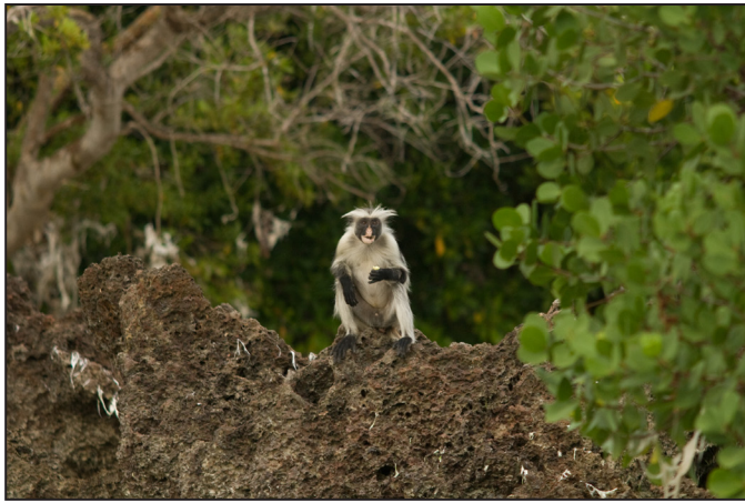
Figure 3. Adult male Zanzibar red colobus Procolobus kirkii eating mangrove flowers on coral rag, southern Uzi Island, Zanzibar Archipelago, Tanzania.

tended to be associated with lower numbers of monkey sightings, with an exception in Uzi, where Sykes's monkey and human encounter rates tended to correlate, suggesting their use of relatively disturbed forest at this site (Table 2).