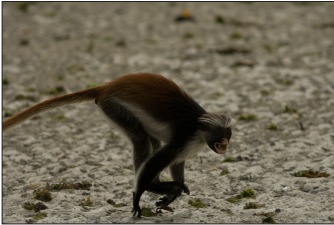
Figure 5. Adult male Zanzibar red colobus Procolobus kirkii running along a sandy beach, Vundwe Island, Zanzibar Archipelago, Tanzania.

Tana, Kenya, where P. rufomitratus lives at high densities of 165 individuals/km 2 (similar to the density of red colobus estimated in Uzi). The farm-field groups in Siex's study (Siex 2003), at a population density more than double of those in the Jozani groundwater forest (550 monkeys/km 2 compared with 235 monkey/km 2 ), were highly unstable and living at high densities because of habitat compression rather than intrinsic growth.