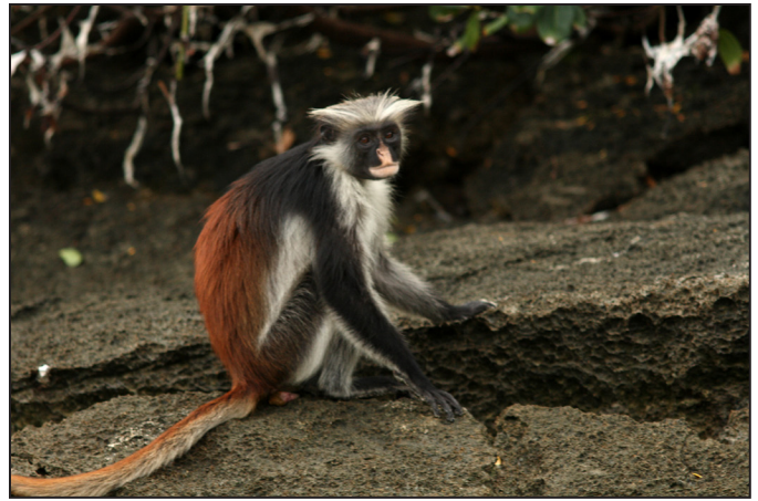
Figure 4. Adult male Zanzibar red colobus Procolobus kirkii sits on jagged coral rock formation, Vundwe Island, Zanzibar.

The results of these surveys, while conducted almost a decade ago, are suggestive of the relative value of degraded habitats to colobus and Sykes's monkeys. This value may