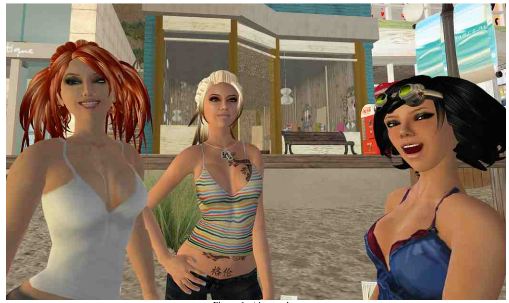
Figure 1: 'Avatars'

Figure 3 depicts 3 'Avatars' who impersonate 3 trendy, young women who can be friends going out to entertain themselves. 'Avatars' are able to build their own property and own land in the digital world. This land could be used for leisure or to make business transactions. The idea of digital property and the ownership model came from existing popular games such as Monopoly and Poker (Ondrejka, 2005). Currently, virtual worlds are also used for commercial purposes since increasingly many people own and run virtual, profitable, businesses (Mansfield, 2008).