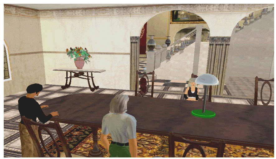
Figure 4: Second Life House

SL official website, this 3D on-line virtual earth is massive and growing at a rate of 600 acres per month. On-line SL residents are allowed, for example, to build houses, play sports, design and do crafts (Figure 4). One can actually pay a minimum monthly fee of ten US dollars to own one's own land or one can spend hundreds of dollars to buy an island. A set of powerful tools are available to the user to build and design objects, and the use of scripting language provide users with the flexibility to develop and build advanced features that could allow objects to assume manners and moods. In this digital world, one can create a new reality far away from RL.