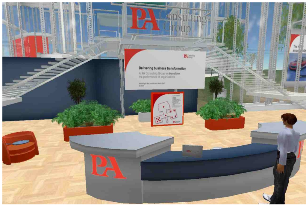
Figure 3: PA Consulting SL Virtual Office

According to Ondrejka (SecondLife, 2007), who is one of the modelling founders of Linden Lab, SL is a 'digital world unlike any other'. Any on-line user could register for free with SL and become a resident. It is an internet based virtual world that is entirely built and owned by its residents. In SL the sun rises and sets as in RL and trees and grass blow in the wind (White, 2008).