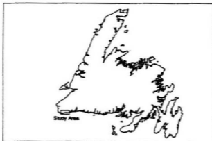
Figure 1: Southwest Coast of Newfoundland