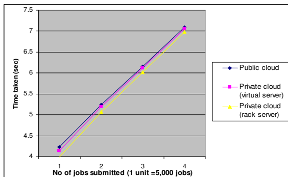
Figure 3: Timing benchmark comparison for GridSAM 2.3

This relates to Middleware Framework (MF) which contains core CCBF components such as GridSAM for portability. GridSAM 2.3 is chosen as it is widely used in the UK community and is very easy to modify the Job Submission Description Language (JSDL) for job submission. GridSAM 2.3 allows multiple submissions for up to 20,000 jobs submitted at each instance. A Java program, Primes, is written to list prime numbers, and is able to submit jobs to Private and Public Clouds. Here is an example: Two JSDL files, primes-0to10000.jsdl and prime-10001to20000.jsdl are written to send 20,000 jobs, and a primes_file.pl is modified to lists prime numbers between 0 and 20,000. This includes two stages. Firstly, it involves with job submission and its status check. Secondly, the result is computed and stored in the GridSAM client. For Cloud demonstrations, the first stage is used to measure the time taken of the job submission, and compare required time with the same set-ups and experiments described in Section 4. The GridSAM 2.3 server does not support desktop. Hence, Public and Private Clouds are used for experiments, with their outcomes summed up in Figure 3.