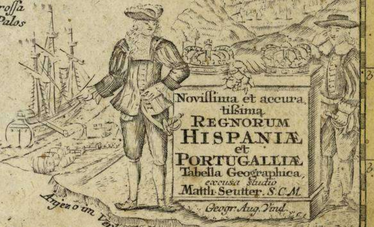
Novissima et accuratissima REGNORUM HISPANIAE et PORTUGALLIAE Tabella Geographica excusa studio Matth. Seutter. S.C.M.