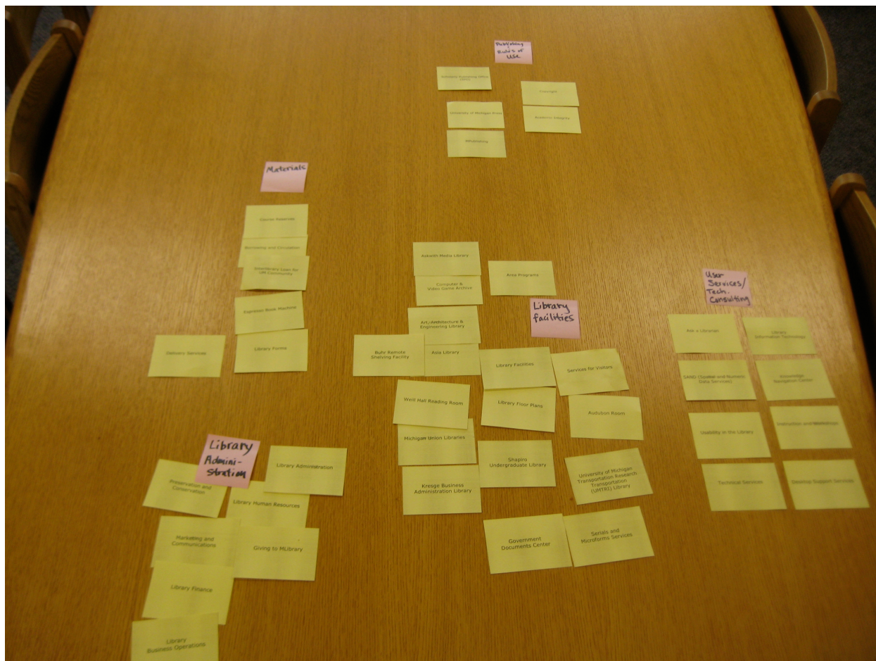
Figure 2. All categories from the graduate student group's card sort.