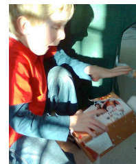
Figure 1 A moment of excitement