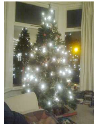
Figure 3 The Christmas tree, an anchoring point.