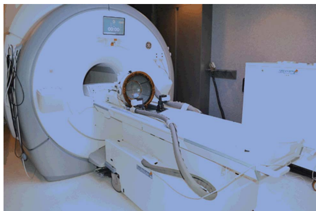
Figure 2 Commercially available magnetic resonance-guided (MR-guided) focused ultrasound. 10

A further multicentre prospective trial in the USA randomised patients to SRS with high (24 Gy) or low (20 Gy) dose delivered to the targets. 25 At 3 years, seizure freedom was 77% in the high dose and 59% in the low dose group. Again, the neuropsychological profiles compared favourably with results from conventional surgery.