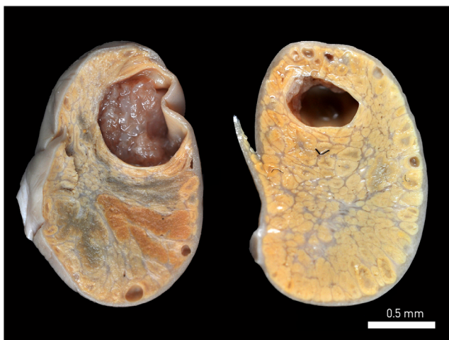
Figure 3. Active true corpora lutea (left) and a preovulatory antral follicle (right). doi:10.1371/journal.pone.0093625.g003

The rate of reproduction for woolly monkeys is considerably lower than that of other frequently hunted mammals in the Amazon region [41,45,46], making them more vulnerable to overhunting [47]. Woolly monkeys are being harvested on a wide scale, generally unsustainably, and this is likely to increase with the increase in oil exploitation that is predicted in many parts of Amazonia [48–50]. One of the major problems in the assessment of a primate population's vulnerability to extinction is poor knowledge of its reproductive biology [51]. The widely-used Production Model [8] has been applied with minimal reproductive