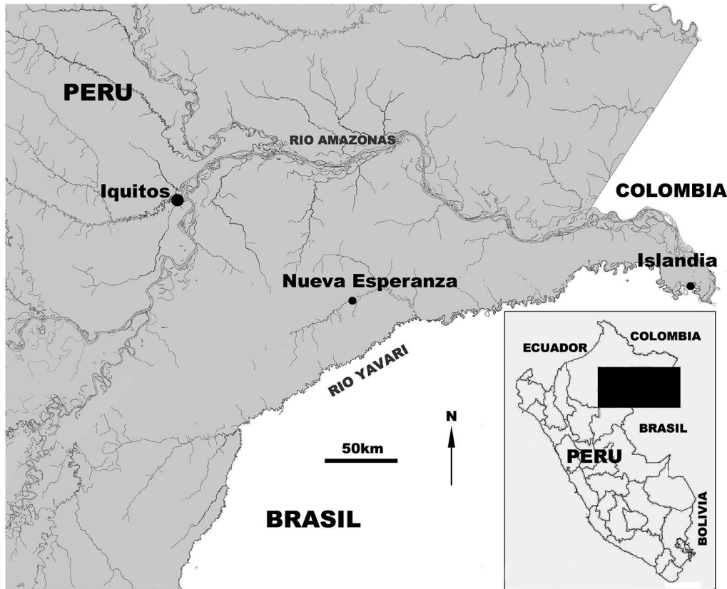
Figure 2. The Yavari Mirin River and surrounding area, including Esperanza, the main community in the area. doi:10.1371/journal.pone.0093625.g002

pregnancy (Table 2). Non-pregnant females were classified as in follicular ( n = 27 ; 45.0%) or luteal phases ( n = 33 ; 55.0%). Two pregnant females were considered to be at the embryonic stage of pregnancy, with an embryo between 0.5 and 1 cm in size and with limb buds present. Twenty pregnant females were considered to be at the fetal stage of pregnancy, with developed eyelids, fingers and external genitalia, and all the vital organs in place. Due to the difficulty of diagnosing pregnancy during the 2 first weeks, we