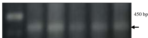
Figure 2. Polymerase Chains Reaction (PCR) L1-HPV gene in BOSC tissue frozen section, amplified 450 bp long.