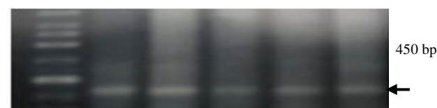
Figure 3. Polymerase Chains Reaction (PCR) L1-HPV gene in OSCC tissue frozen section, amplified 450 bp long.