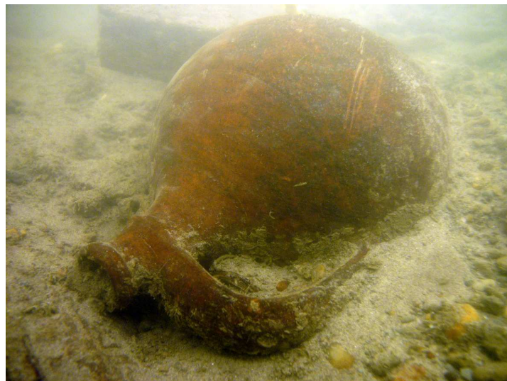
Late 17 th -early 18 th c. jug at Drávatamási

We mapped the Drávatamási logboat site, and the number of logboats raised to 34. The most important result is the dendrochronological dating of the boats. We collected a large number of wooden samples from logboats, timbers and natural trees brought by the river. We found, that the boats are dated from the same period. Fortunately it was possible to link the tree-ring sequence to the Slovenian chronology, and the date strengthened our previous hypothesis, that the site is the remain of a Turkish pontoon-bridge destroyed in 1603 by a Hungarian raid. Some human remains (including a skull) were collected. The site was in use later in history as documented by some 18 th and 19 th c. material (hemp washing place as modern name describes).