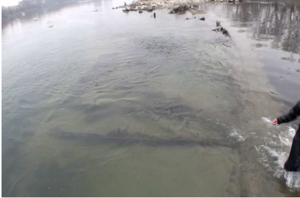
The modern wreck at Barcs (built ca. 1840-60)

We mapped the Drávatamási logboat site, and the number of logboats raised to 34. The most important result is the dendrochronological dating of the boats. We collected a large number of wooden samples from logboats, timbers and natural trees brought by the river. We found, that the boats are dated from the same period. Fortunately it was possible to link the tree-ring sequence to the Slovenian chronology, and the date strengthened our previous hypothesis, that the site is the remain of a Turkish pontoon-bridge destroyed in 1603 by a Hungarian raid. Some human remains (including a skull) were collected. The site was in use later in history as documented by some 18 th and 19 th c. material (hemp washing place as modern name describes).