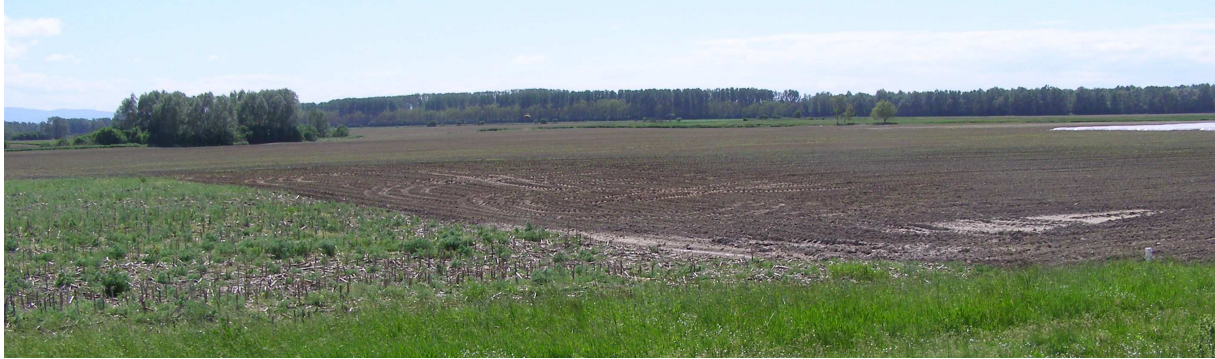
Arpadian settlement is contoured by a dark surface near Tótújfalu

fragments on the edge of the settlement, close to wet depressions (former riverbeds), which are the natural sources of alluvial iron. These sites are often just 0.5-1 m higher than the surrounding floodplain, and the settlement size is smaller than a ripe-medieval village. We documented the same pattern in the case of our two sample areas (Somogyudvarhely-Berzence and Drávatamási-Szentborbás area).