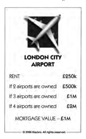
Figure 14.4 London City Airport square on the 70th anniversary edition of the Monopoly board game

Certainly the employees, many of whom have now worked theire since before it opened feel like a community. 'We are a close knit group' in a place with 'a special atmosphere' (employees' focus group).