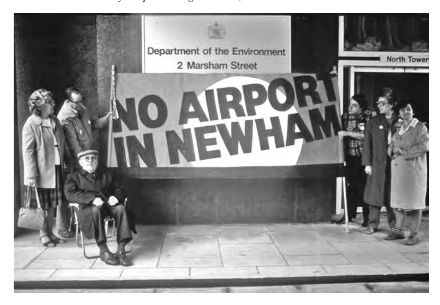
Figure 14.1 Protest against the building of the London City Airport. Photo and banner: Docklands Community Poster Project