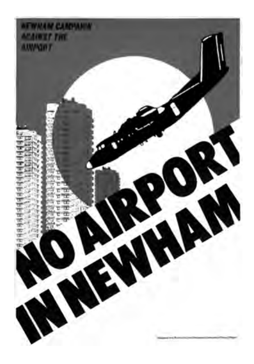
Figure 14.2 Anti airport poster. Loraine Leeson and Peter Dunn, Docklands Community Poster Project,1983