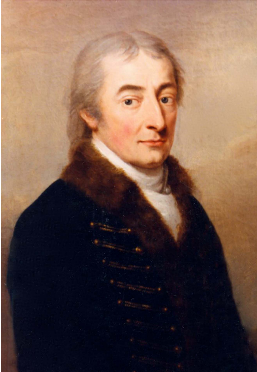
Figure 1. Count Imre Festetics around 1819. Portrait by Oelenhainz August Friedrich, original painting found in Kőszeg City Museum (No. 55.11). doi:10.1371/journal.pbio.1001772.g001

thoroughgoing advancement of this branch of the economy and the manufacturing and commercial aspects of the wool industry that is based upon it,” but usually called the Sheep Breeders’ Society (SBS) ( Schafzüchtervereinigung ). The SBS focused on practical problems in the wool industry and published a weekly journal, Oekonomische Neuigkeiten und Verhandlungen (ONV; Economic News and Announcements), edited by the society secretary Christian Carl André (1763–1832), the leading figure in the development of natural and agricultural sciences in Moravia at that time. The annual meetings attracted a