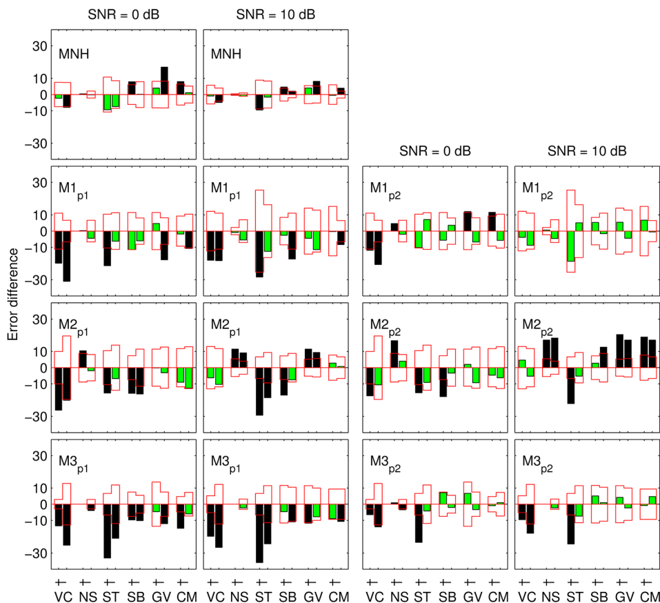
Fig. 2. (Color online) Error patterns for a model of NH listeners and models of individual HI listeners. Subscripts p1 and p2 indicate phase-1 and phase-2 models, respectively. Errors are presented as error differences between the predicted and the measured DRT data (model - human), in percent. The zero line reflects a perfect match. The boxes represent the standard deviation of the data. When the predicted error rate was within 1 standard deviation, the bars are indicated by a green (gray) color.

The differences between predicted and measured error rates for the three HI listeners are shown in the two left columns of Fig. 2, marked M1 p1 , M2 p1 , and M3 p1 . Specifically, model M1 p1 could account for the errors of listener S1 in the dimensions NS, ST-, SB, GV+, and CM+, while errors were underestimated in VC, ST+, and CM-. Model M2 p1 accounted for the measured errors of listener S2 in the dimensions ST-, GV, and CM at the SNR of 0 dB, and VC, SB-, and CM at the SNR of 10 dB.