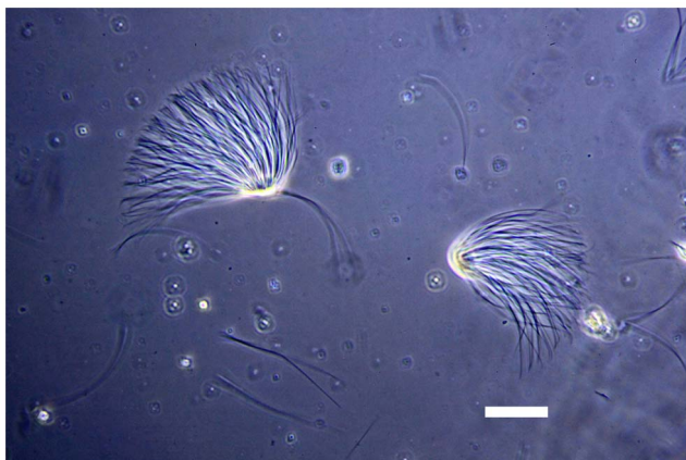
Figure 1. A pair of sperm bundles or spermatodesmata from Lasius pallitarsis , Phase Contrast (PC) microscopy. Image captured with blue filter at approximately 400 \times . Horizontal scale bar represents 20 micrometers. doi:10.1371/journal.pone.0093383.g001

A digital video was prepared of the sperm bundles as viewed microscopically with PC, HMC and DIC. The video, which we have posted on YouTube, clearly shows the characteristic