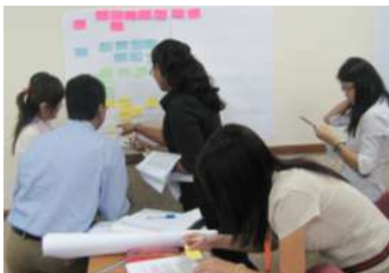
Figure 1. Roadmapping workshop.

This exercise provides an opportunity for the team members to reflect their opinions and thought on the same platform. During the exercise, the top-level managers should seek to clear obstacles. It is expected that various obstacles may appear such as the non-cooperative behavior from team members. It is believed that top-level managers have the influence and power to remove these obstacles. That's why they are invited in the workshop. Figure 1 shows the activities of road mapping in a workshop.