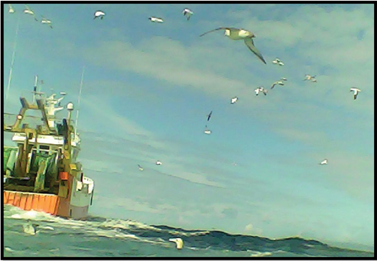
Figure 1. Bird-borne cameras reveal seabird/fishery interactions. All tracked gannets photographed fishing vessels, often in the company of large groups of other scavengers. doi:10.1371/journal.pone.0057376.g001

seabirds and fisheries at meso [17] and sub-mesoscales [15,18]. Nevertheless, even these approaches have a number of limitations: spatial overlap between seabirds and vessels does not necessarily mean interaction; vessel location data is normally gathered at a much coarser resolution than animal-borne tracking devices; gear-type information can be difficult to obtain; not all vessels are legally required to use vessel monitoring systems; and illegal, unreported and unregulated (IUU) fisheries may have significant ecological impacts but remain virtually impossible to monitor [19].