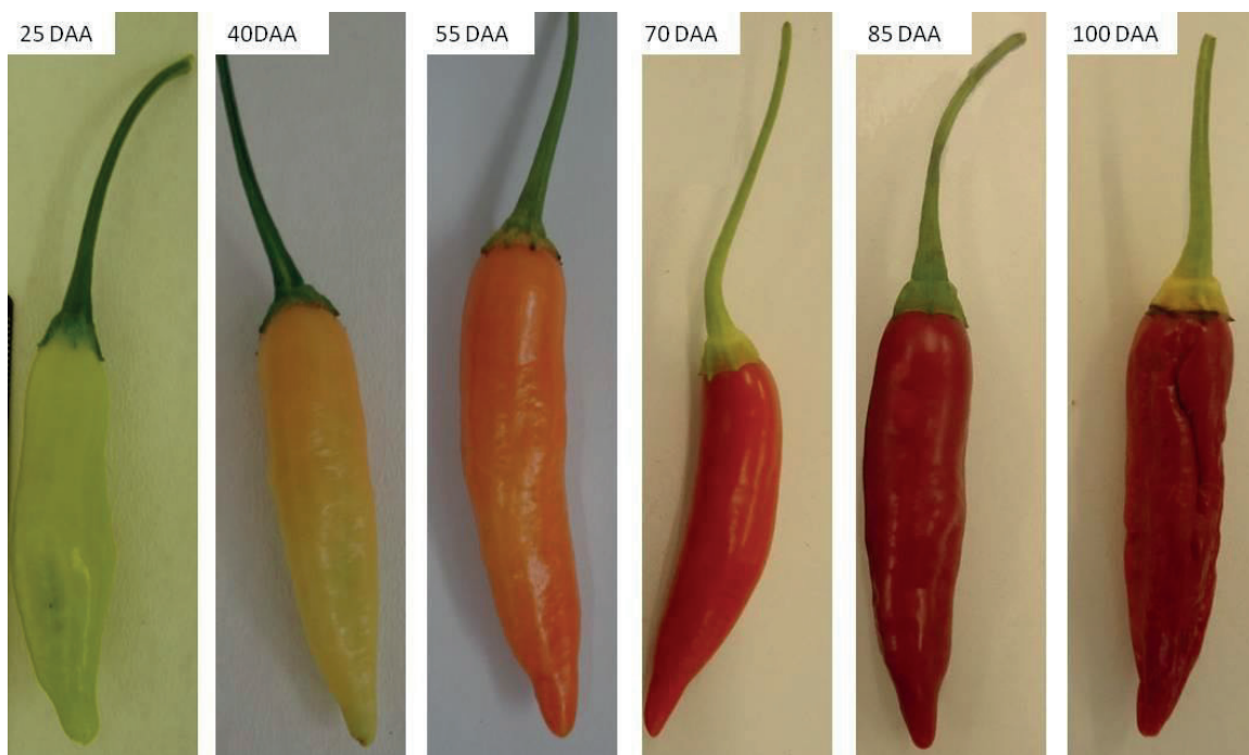
Figure 1. The appearance of fruits during the maturation process of ‘dedo-de-moça BRS Mari’ hot peppers ( Capsicum baccatum var. pendulum ) on different days after anthesis (DAA).

The hot peppers were green, yellowish green, orange, and red on 25, 40, 55, and 70 DAA and extreme red and intense red at 85 and 100 DAA, respectively (Figure 1). In their assessment of the maturity stage of ‘dedo-de-moça’ hot peppers for seed production, Pereira et al. (2014) found that the hot peppers were intense red on 45 DAA. This occurred because hot peppers have different harvest seasons according to the growing region and season. Crop cycle and harvest season are directly affected by the climatic conditions, cultivation treatments including fertilization and irrigation, pest and disease incidence, and pest control measures (EMBRAPA HORTALIÇAS, 2007).