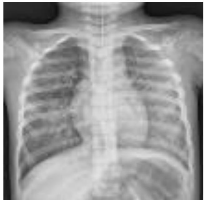
Fig. 1. Chest radiograph of a patient with enterovirus 71 infection presenting with pulmonary hemorrhage and shock. Note the diffuse haziness on both lungs.

Brainstem encephalitis is the most common neurological presentation, accounting for 58% of neurological manifestations, followed by aseptic meningitis (36%), and brainstem encephalitis with cardiorespiratory dysfunction (4%) 29 . Despite the recent discovery of receptors for EV71 in human cells 35,36 , the reason for the predominant involvement of the brainstem in EV71 infection is currently unknown. EV71 brainstem encephalitis occasionally induces autonomic dysfunction, such as fluctuating blood pressure and pulmonary hemorrhage/edema (Fig. 1). Most deaths caused by pulmonary hemorrhage in patients with EV71 brainstem encephalitis usually occur within 24 hours after admission because the disease rapidly progresses to the critical stage 2,37 .