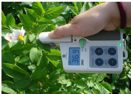
Fig.1 The leaf chlorophyll content monitoring with SPAD 502 Plus Chlorophyll Meter