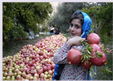
Paveh, Kermanshah, Iran.