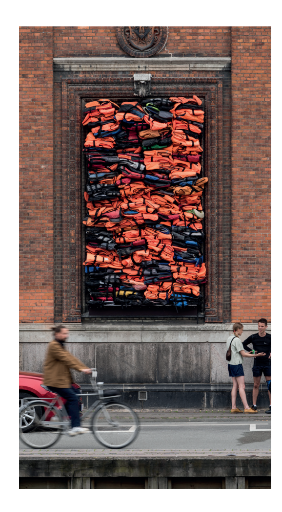
fig. 1 Ai Weiwei: Soleil Levant, Kunsthal Charlottenborg, 2017.

I examined them from a close distance, seeing each individual life jacket, their materiality, the fabrics, the colours, and the straps hanging down. Most of them were orange, and a few of them blue and red. Because