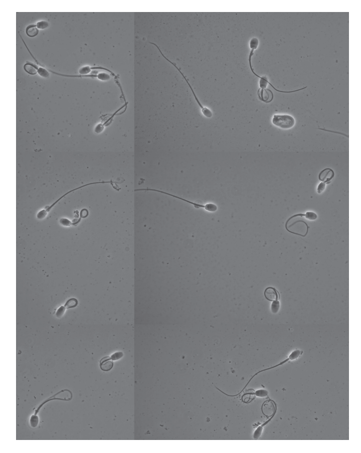
Figure 6: Hypoosmotic swelling test: Spermatozoa with intact membranes present various degrees of swelling and coiling of the tail and mid-piece

Most studies rely on traditional methods for semen evaluation such as post-thaw progressive motility at various intervals during incubation. In recent years, techniques used in for the evaluation of semen in other species have been adapted to camelid semen and include hypoosmotic swelling test (incubation in fructose or sucrose solution of 50 to 100 mOsm at 37°C for 45 minutes (Figure 6), special staining techniques (Isothiocynate-conjugated peanut agglutinin (Morton et al. , 2007; 2008), Chlortetracycline staining for spontaneous capacitation (Crichton et al. , 2015). All these add more rigor in the evaluation of different parameters after cryopreservation but have not been yet been correlated to fertility.