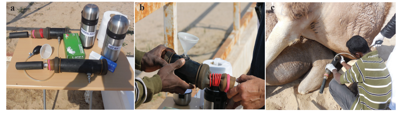
Figure 1: Artificial vaginal for collection of semen. (a) Type of artificial vaginal used for dromedary (b) Coil on short artificial vagina to simulate cervical rings (c) Collection of semen on a receptive female mount