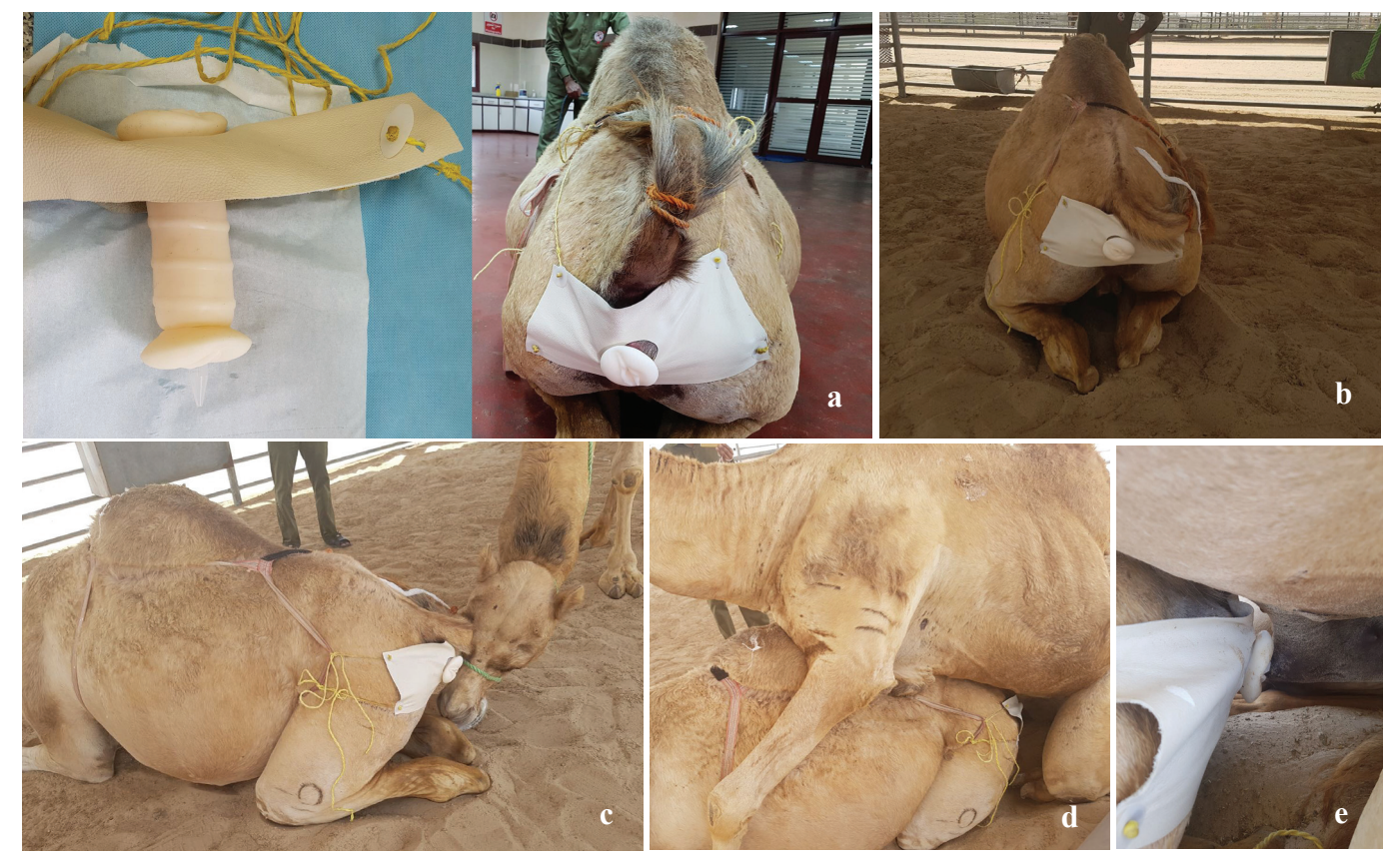
Figure 3: Semen collection using a female fitted with a condom. (a) Condom device (left) is inserted in the vaginal of an estrous female and secured with a harness (right) (b) Female with secured intravaginal condom in the breeding pen (c) Male teasing the female with intravaginal condom (d/e) Male breeding within the intravaginal condom

In addition, the viscous material in the ejaculate is not a distinct fraction that can be easily filtered out as in other species but is distributed evenly throughout ejaculation. Viscosity of semen is often estimated by the thread testing technique which we have described in 1997 (Tibary and Anouassi, 1997b) (Figure 4). It is important to note that this test does not measure structural viscosity but rather the rheological properties of seminal plasma (Giuliano et al. , 2010; Casaretto et al. , 2012).