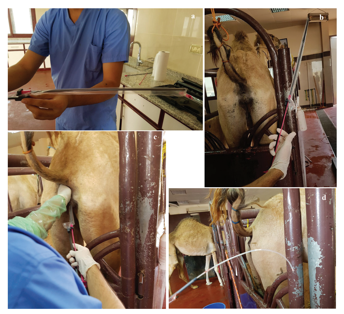
Figure 5: Deep horn insemination gun. (a) Sterile deep horn insemination gun (b) Female prepared for deep horn insemination (c) Insertion of the deep horn insemination gun and transrectal guidance of the flexible catheter (d) Deep horn AI gun after insemination. Note the flexible catheter within the rigid outer catheter

improve camel spermatozoa viability during storage at 5°C. A small fertility trial resulted in 46.5% (6/13), 22.2% (2/9) and 37.5% (3/8) in females inseminated 48 hours after hCG administration with 100 million spermatozoa in non-diluted semen, extended cooled semen without catalase and extended cooled semen with catalase, respectively (Medan et al. , 2008).