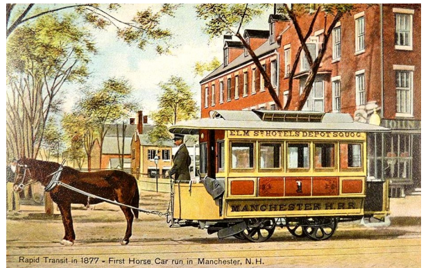
Fig. 2. Horse-drawn tram in Manchester (1877)