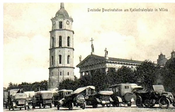
Fig. 7. Cars at the petrol station at the Cathedral (beginning of the 20th century)

In 1926, following the order issued by the local government, horse-drawn railways in Vilnius were dismantled, and the rest of the coaches were sold to the city residents and turned into cattle sheds used for keeping