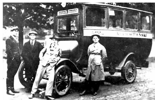
Fig. 8. A bus manufactured by 'Ruch Wileński' (1928) (source: Wilnoteka 2014)