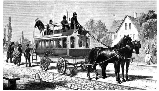
Fig. 1. The first horse-drawn coach (1872)

The horse-drawn tram was functioning in Vilnius for 22 years (Fig. 3). Unfortunately, the city has still been