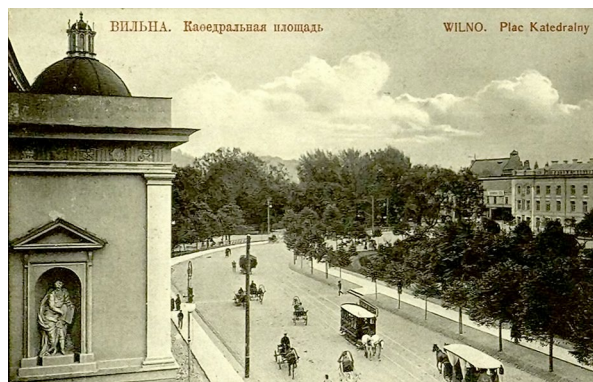
Fig. 5. The konkė at the Cathedral Square