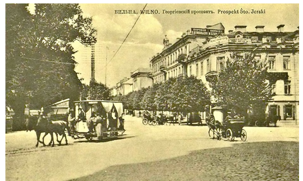
Fig. 3. The konkė coach at the beginning of the Georgijevsky prospect (now Gedimino pr. )

waiting for the electric tram. Yet in 1823, horse-drawn omnibuses were running in the bumpy streets of Paris (Fig. 4) thus carrying up to 50 passengers (Wikipedia 2015a).