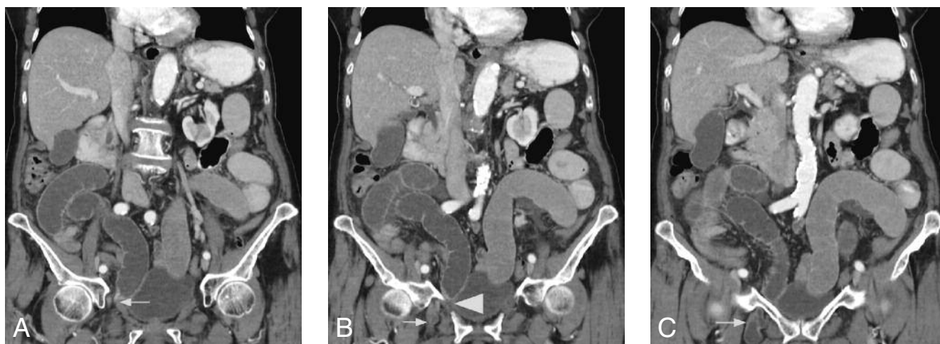
Fig.2. — Reconstructed coronal CT image (A) shows multiple dilated small bowel loops and level of herniated small bowel through the obturator canal (white arrow). B shows multiple dilated small bowel loops and herniated small bowel (white arrow) inferior to the right ramus pubis inferior (arrowhead). C. shows multiple dilated small bowel loops and herniated small bowel (white arrow) inferior to the right ramus pubis inferior.

obturator hernia was made. Patient was taken into surgery room for laparoscopic repair.