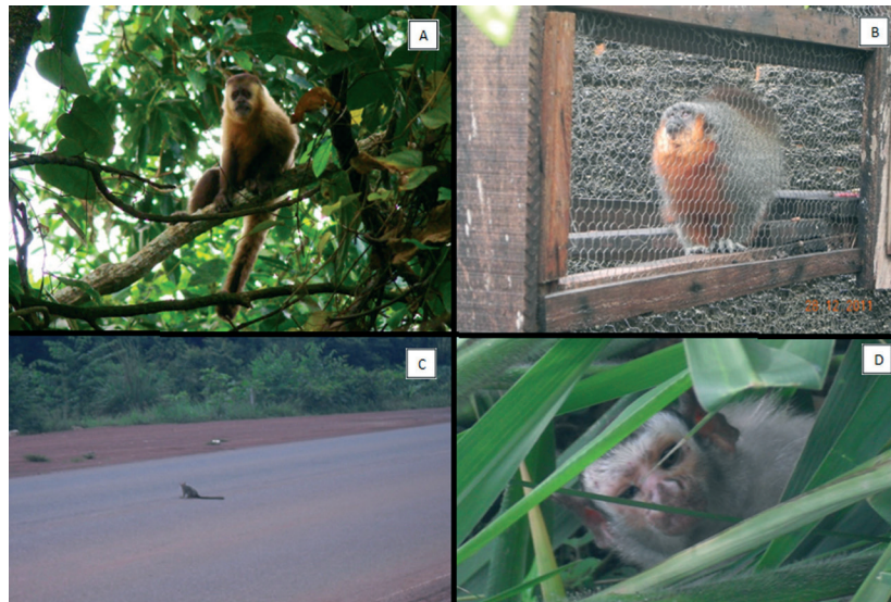
Figure 1. Records of Cebus (Sapajus) libidinosus (1A), Callicebus moloch (1B) and Mico emiliae (1C and 1D).