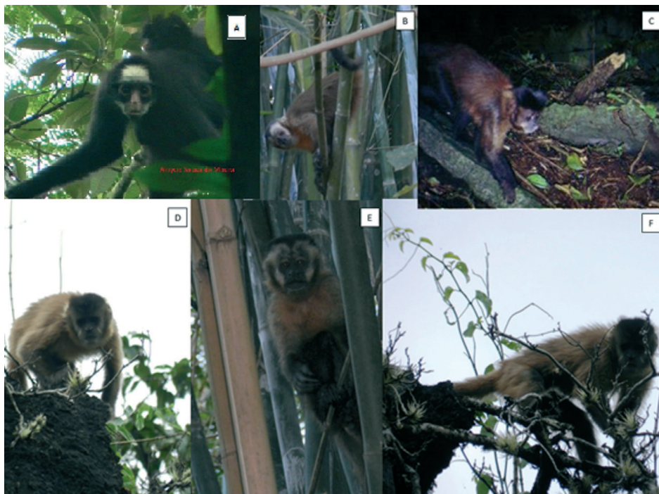
Figure 2. Records from camera traps of Ateles marginatus (1A), Cebus libidinosus (2B, 2C, 2D, 2E and 2F) in natural areas.

Source: elaborated by the authors. Photos taken and made available by Aloysio S. de Moura.