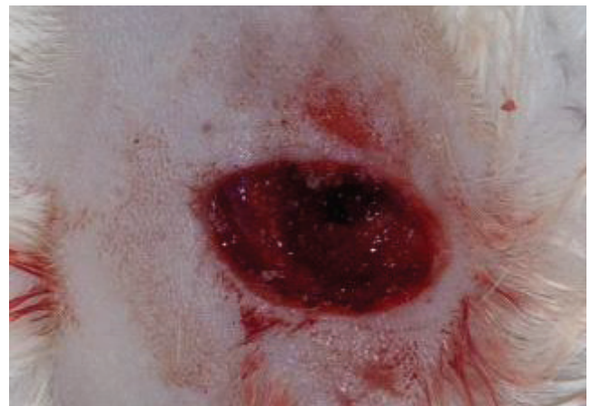
Fig. 2. Insulin-like growth factor 1 solution was locally applied with porcine skin gel was applied to the third group (study group).