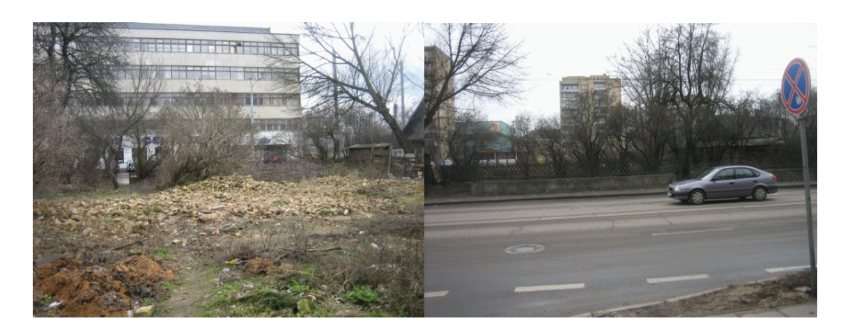
Figure 2. Appraised property (site)