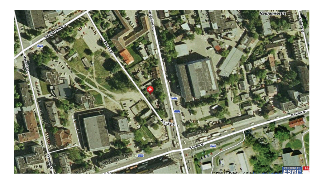
Figure 1. Map of the territory

The site is trapezium-shaped, covers an area of 6.89 ares and is on a level relief (Figure 2).