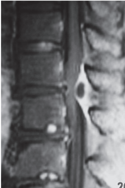
Fig. 4. Magnetic resonance imaging of gadolinium-enhanced T1-weighted image of a patient with amyloidoma (case 13).

vicothoracic (C-T) region and 1 in the L region (Table 2). Histopathologically, the patient treated with CAPD had tumoral calcinosis, and the other 2 had fibrous tissue with no evidence of \beta 2M amyloid deposition by Congo Red and \beta 2M immunostaining. MRI showed T1- and T2-weighted hypointense images in the case with tumoral calcinosis and T1-weighted hypointense and T2-weighted hyperintense images in the 2 cases with fibrous tissue. The tumoral calcinosis case was localized in C-T region, and the fibrous tissue cases in C-T and L regions (1 in each). These tumoral lesions were all determined to be extradural on diagnostic imaging and confirmed during surgery.