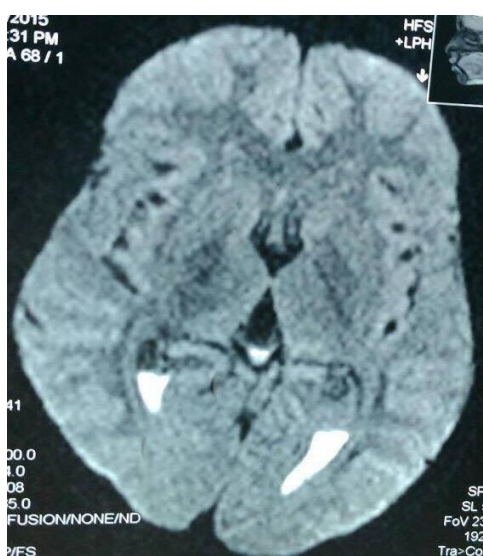
Fig.2: Axial DW image in a 9 years old female shows ventriculitis. DW: diffusion-weighted.