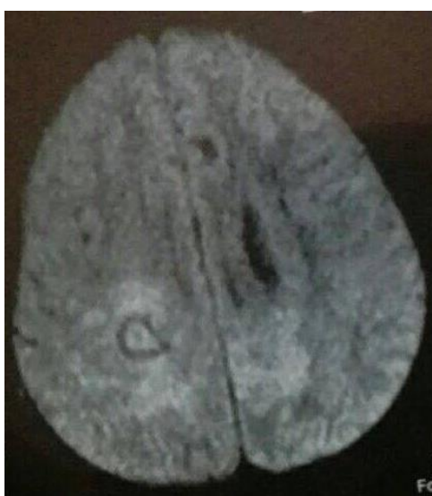
Fig.1: Axial DW image in a 7 years male patient shows right parietal white matter necrosis. DW: diffusion-weighted.