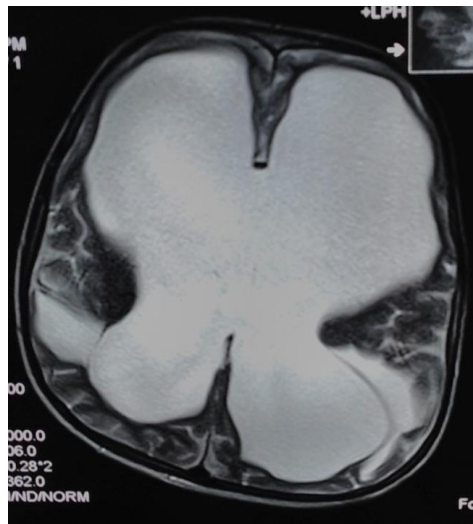
Fig.4: Axial T2 MRI image in a 10 years old male show massive hydrocephalus with periventricular edema.