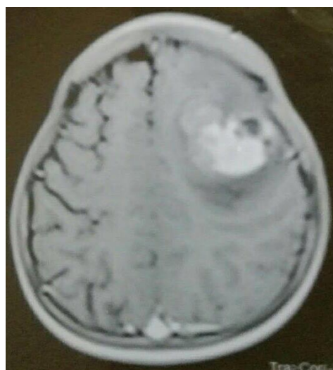
Fig.5: Axial T1 post-contrast MRI image in a 7 years female patient shows left-sided parietal abscess.