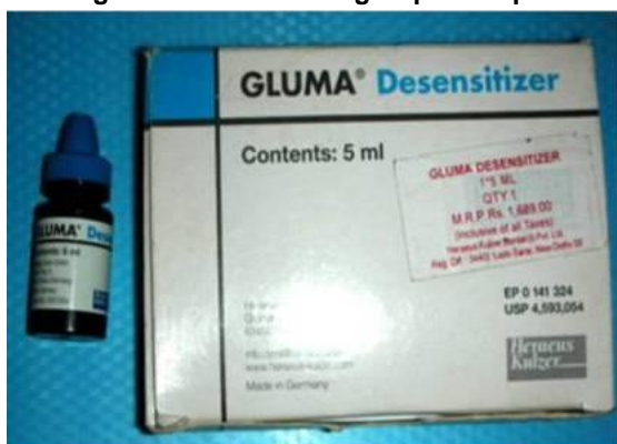
Fig. 1 Desensitizer for group II sample

The total sixty samples are divided into four groups as group I, II, III and IV. Each group consists of 15 samples. The groups II to group IV samples are coated with Gluma, Systemp and Prime desensitizers respectively. The group I samples are left uncoated and used as control group. Five samples are taken from each group and allotted for each luting agent namely Zinc Phosphate, Zinc Polycarboxylate and Resin Reinforce glass ionomer cements and are used to test tensile bond strength.