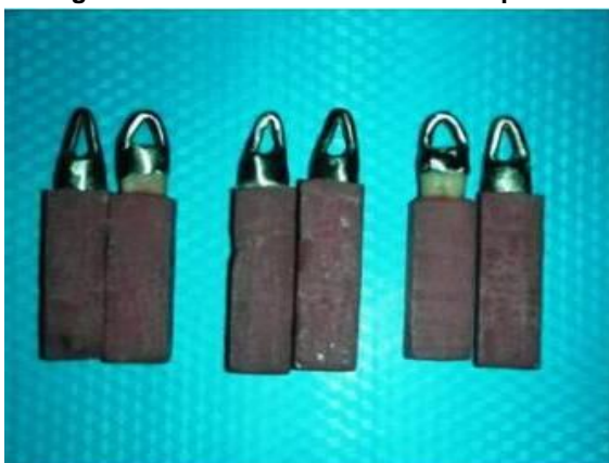
Fig. 2 Metal crown cemented on samples

GLUMA desensitizing agent is applied on Group II samples. Systemp desensitizing agent is applied on Group III samples. Prime desensitizing agent is applied on Group IV samples.