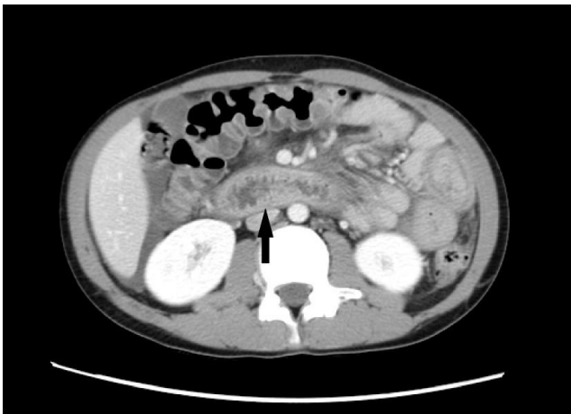
Fig. 1. A computed tomographic scan of the abdomen showing the layered wall thickening and mucosal fold thickening of the duodenum (arrow).

The patient had grossly edematous findings without erosion or ulcer in duodenum on esophagogastroduodenoscopy. Biopsy specimens of the duodenal mucosa showed eosinophilic infiltration in the lamina propria up to 35/high-power field (Fig. 2).