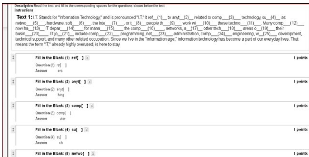
Figure 1: C-Test build in Blackboard.

In 2011, I created an Online C-Test within the Blackboard learning platform when required by my Australian university (James Cook University) to assess the academic language proficiency of a large group (93) of Chinese undergraduate I.T. students studying at a Beijing university on a course provided by my university and in English medium. Through an external quality audit by the Australian Universities Quality Agency (AUQA), concern had been raised at the level of English demonstrated by some students, and my university wished to assess English language levels. Although students were required to have reached an IELTS overall 5 score, or its equivalent, to enter the course, concern had been raised that a large proportion of the 1st year cohort were not functioning acceptably in the learning and teaching medium of English. I was required to design and provide an English language competency test that could be administered efficiently, and did so using a C-Test construct in Blackboard, with four texts sourced from the 1st year IT syllabus.