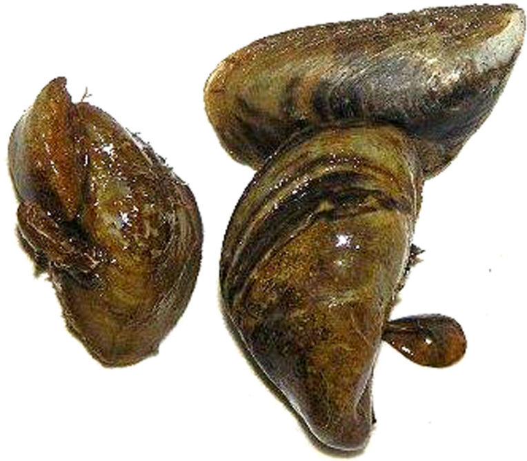
Fig. 2. Specimens of Dreissena bugensis from Romanian Danube