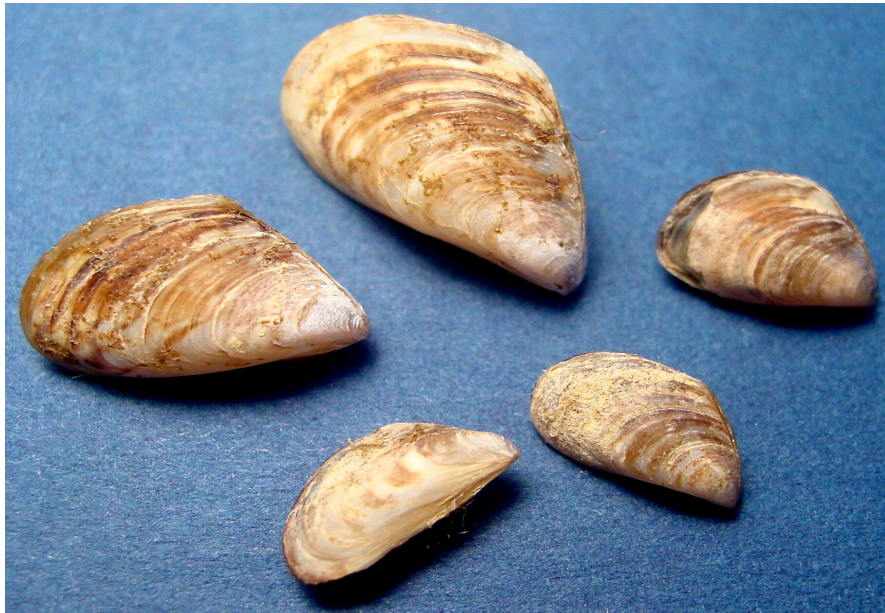
Fig. 3. Dreissena bugensis from Great Lakes, North America