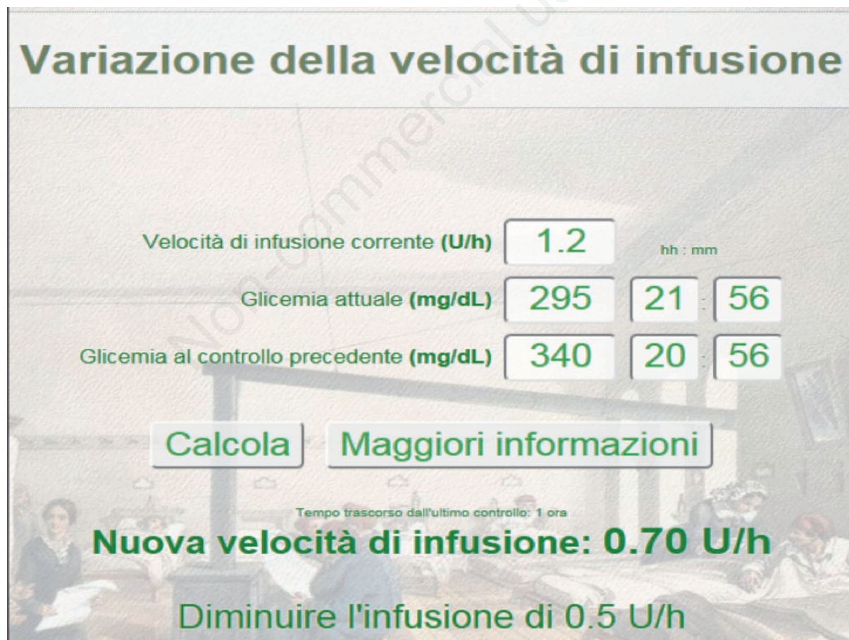
Figure 1. Graphic interface of the computer application used for the calculation of insulin infusion rate variations [the software is in Italian language]. The compilation of three fields Actual infusion rate (Velocità di infusione corrente) , Actual blood glucose (Glicemia attuale) , and Blood glucose at the previous control (Glicemia al controllo precedente) provides an instant calculation of the new infusion rate.