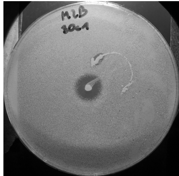
Fig. 1. Growth inhibition zone around the colony of producer strain M2B; an indicator strain – S. aureus 30C1.

Conditions for the effective production of the putative bacteriocin by S. xylosus M2B in a liquid culture were optimized in the terms of medium type, time period and incubation temperature. Comparison of