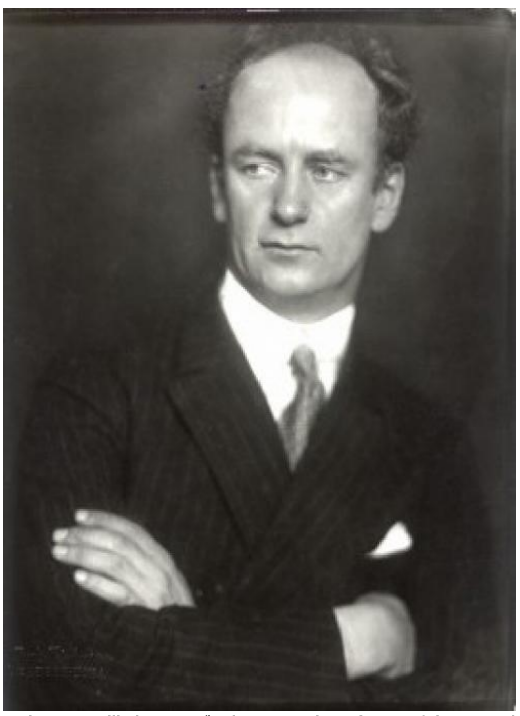
Figure 3: Wilhelm Furtwängler, approximately 1920

In addition to Dahms and Halm, the then 30-year-old Wilhelm Furtwängler (1886–1954), who was engaged as a conductor in Vienna for several years after the war, can also be considered as a recipient of Schenker's German nationalist polemics. Schenker met the conductor in May 1919 at an evening social event at the home of the banker Paul Hammerschlag (1860–1933). The conversation turned to Romain Rolland's (1866–1944) biography of Beethoven, which had been published in German in 1918. It is noteworthy that in the discussion, Schenker tried to make the pacifist Rolland, a strict opponent of nationalism, seem untrustworthy. It is also characteristic of Schenker that he positioned himself in opposition to all of the other people involved in the conversation. Schenker against everyone: that was his preferred modus operandi.