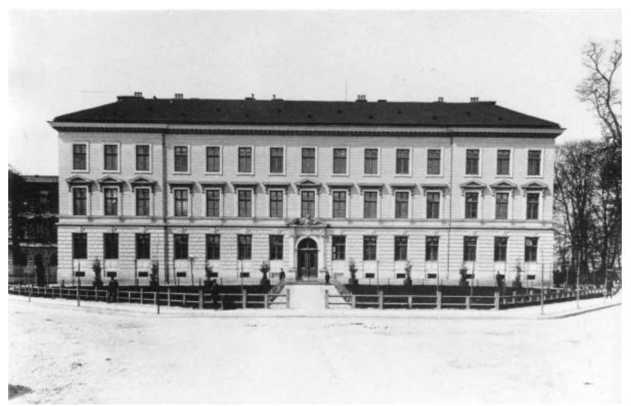
Figure 2: Lviv, Gymnasium IV. Schenker attended the school in the school year 1879-80

report, Polish was the native language of all seventeen of these pupils and German was not the native language of any. [14]