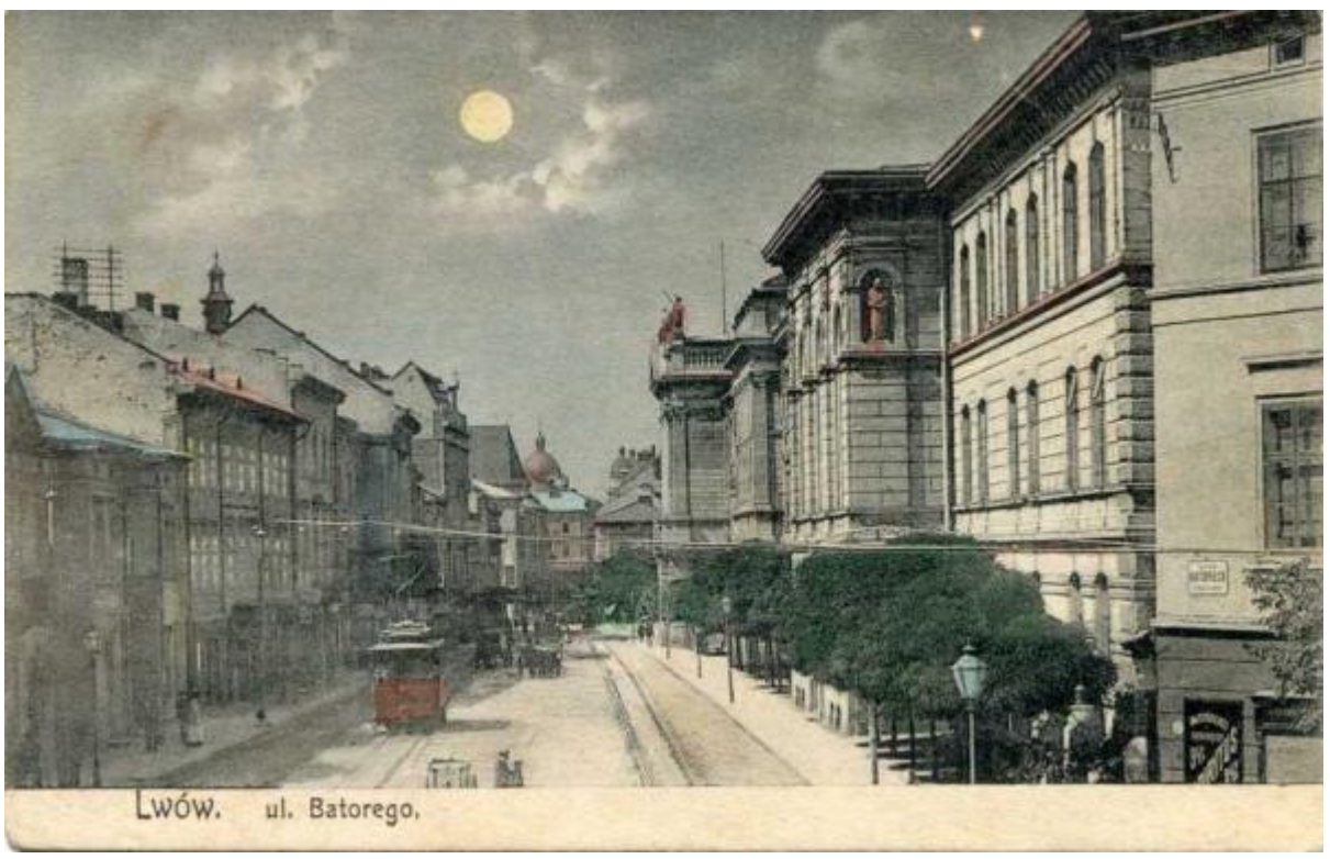
Figure 1: Lviv, Franz-Joseph-Gymnasium at Batoriya street. Schenker attended the school from 1876 until 1879

Schenker's childhood and youth, which, as Lee Rothfarb discusses in a thorough essay backed up by a wealth of source material, was shaped by the powerful Polonization of Galicia made possible through a change to the constitution of the Habsburg monarchy. <sup>[8]</sup> But the same law, the Staatsgrundgesetz of 1867, which guaranteed Jews and Christians the same rights, also formed the basis of Jewish emancipation. Newly established secondary schools, especially in Galicia and Bucovina, gave talented children from Jewish families previously unimaginable opportunities for advancement. The proportion of Jewish pupils was relatively high. <sup>[9]</sup> At the same time, the proportion of Polish speakers in Cisleithania grew from 14.9 percent in 1880 to 17.8 percent in 1910. It was becoming more common for German-speaking Jews in Galicia to report Polish as their native language. In 1880, 60.4 percent of Jews reported their native language as Polish, increasing sharply to 92.5 percent in 1910. <sup>[10]</sup> Schenker grew up in a multi-ethnic culture where Yiddish, German, Polish, and Ruthenian were spoken. He attended secondary school in Lemberg and Berezhany, schools taught in Polish; the languages taught at these schools included German, Russian, Latin, and Greek. <sup>[11]</sup>