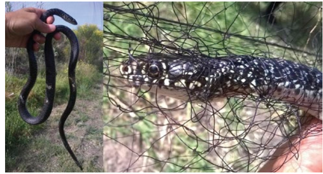
Fig. 2. The specimen from Ventotene island (RL79). The individual was found stuck in a mist net trap and later released.

Interestingly, the four specimens from the Pontine Islands showed a colour pattern which resemble the "abundistic" morph, which is in the middle between the "carbonarius" (melanic/melanotic) and the "viridiflavus" (black and yellowish) colour patterns. The "abundistic" phenotype was previously reported only in Sardinia, Corsica and the Tuscan Archipelago. However, Schätti and Vanni (1986) reported similarities between specimens from the Pontine Islands and the dark coloured ones from Emilia Romagna now considered belonging to H. carbonarius . In particular, the individual sampled from Ventotene (RL79, Fig. 2) had a very dark dorsal with